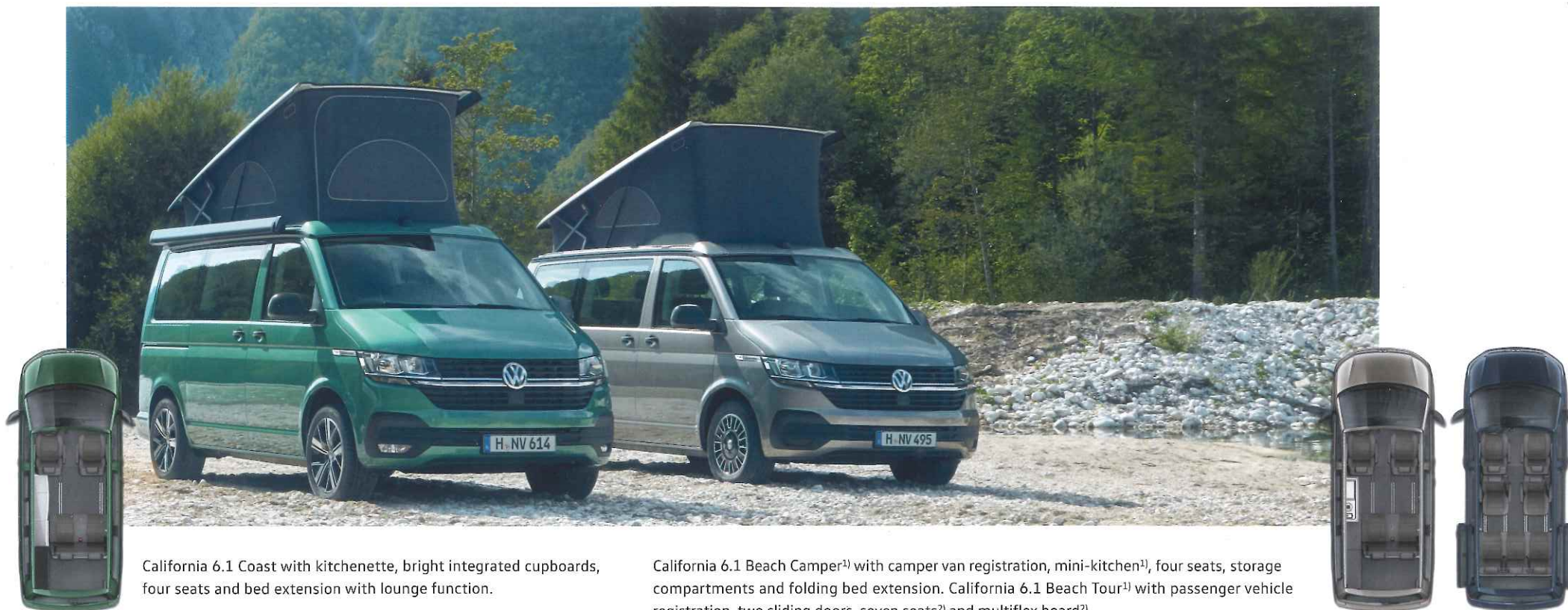
California 6.1 Coast with kitchenette, bright integrated cupboards, four seats and bed extension with lounge function.