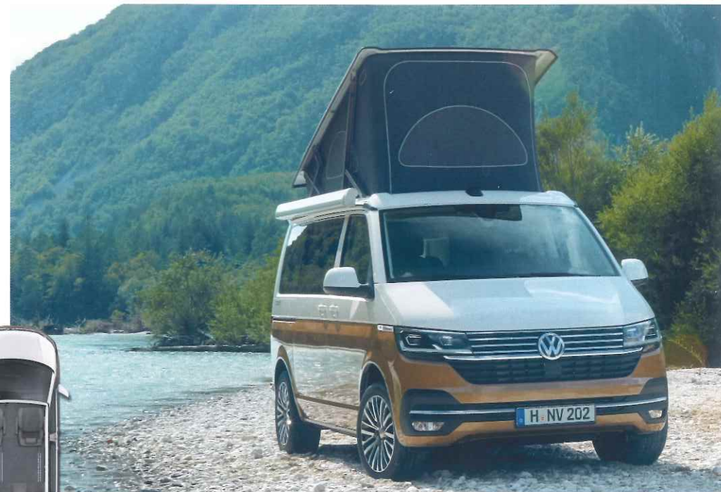
California 6.1 Ocean with kitchenette, dark integrated cupboards, four seats and bed extension with lounge function.