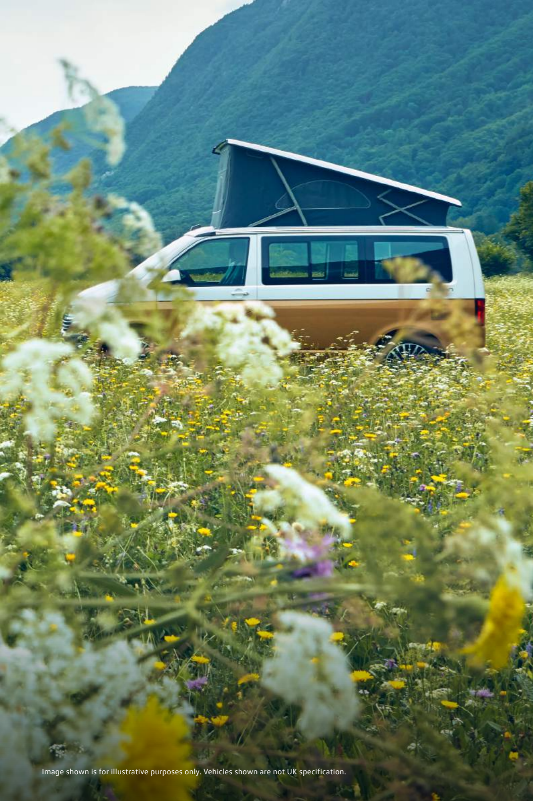
Image shown is for illustrative purposes only. Vehicles shown are not UK specification.